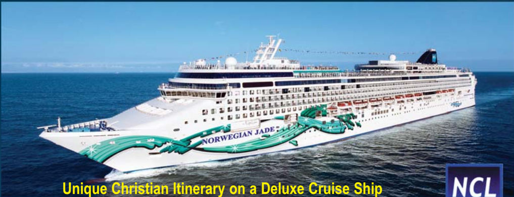
Unique Christian Itinerary on a Deluxe Cruise Ship